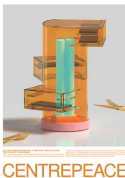
Concept board (JPEG and PDF 10MB)